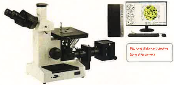
PLL long distance objective Sony chip camera